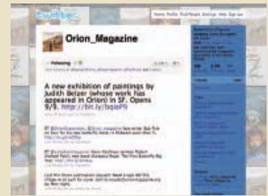
ORION ON TWITTER

As the year draws to a close, gifts of appreciated stock are one great way to support Orion , and may also confer tax advantages. For information about how to make a gift of stock to Orion please call us at 888/909-6568 ext. 10.