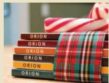
ORION FOR THE HOLIDAYS