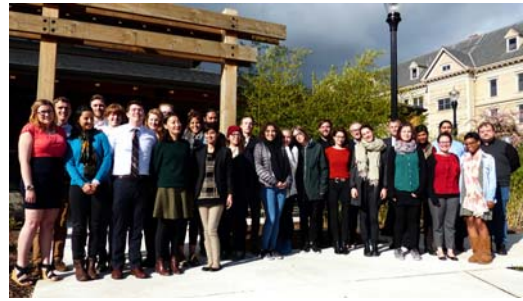
The symposium group after their successful conference at the Asian-Pacific Cultural Center at OSU

Next Year: 15th Transatlantic Students Symposium, "Challenges to Democracy and Supranationality." Rome, Warsaw, Berlin, Spring 2017