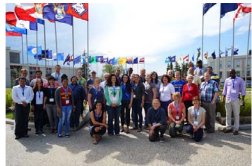
ICRPS students and faculty in Fairbanks, Alaska

The 2016 ICRPS Summer Institute convened for thirteen days and involved approximately 30 graduate students and numerous faculty members from universities around the world. Sessions were supplemented with field trips, group work, and student presentations. The Institute provided a unique opportunity for students from a range of OECD countries to meet and work together on comparative rural policy issues and make invaluable research and networking contacts. Web Site: icrps.org/index.php