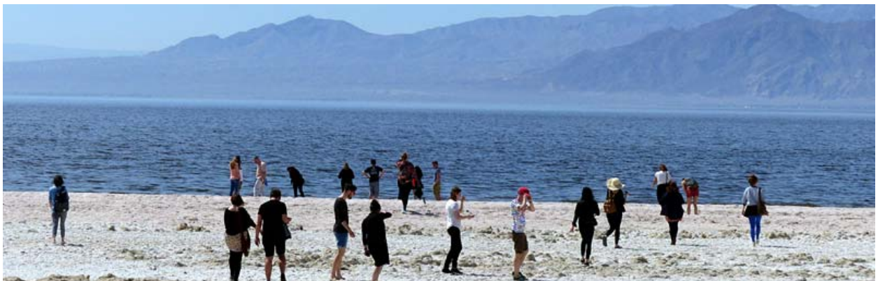
The Transatlantic Students symposium group at the Salton Sea