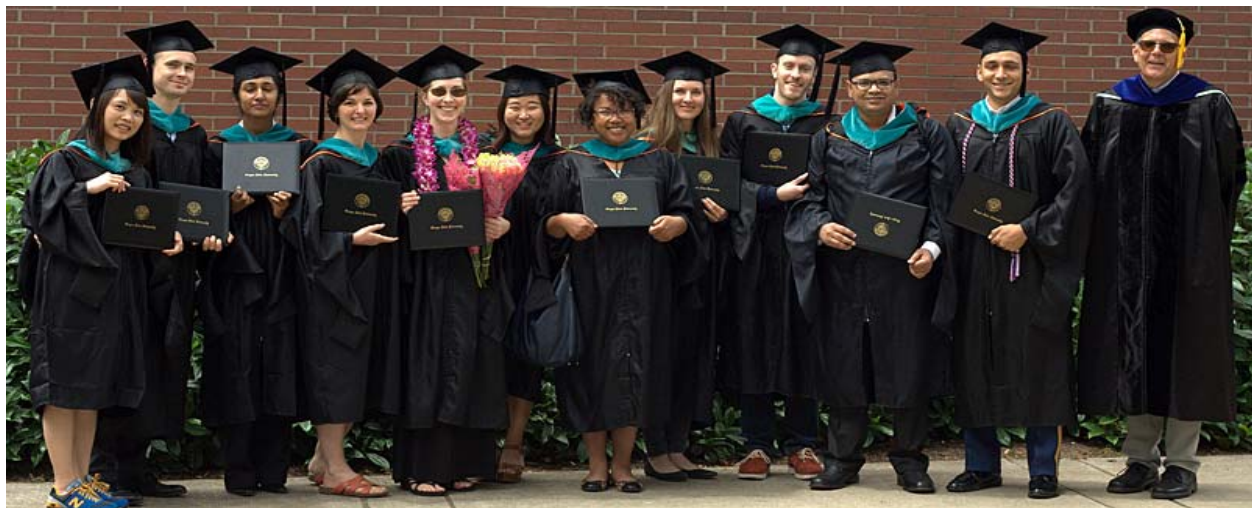
Graduates at the 2016 Commencement Ceremony